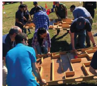
Team Maze Craze