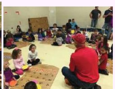
Team Giant Bingo